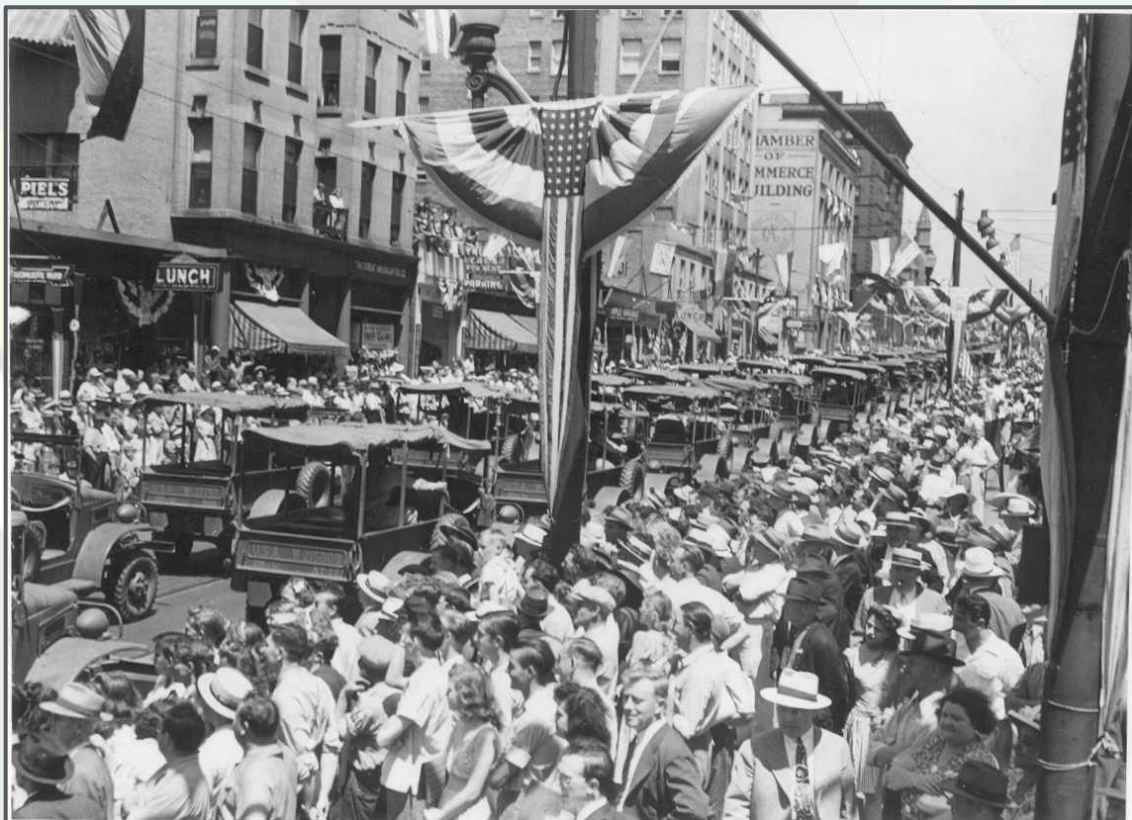
Parade of Progress, Scranton PA, July 1941. A line of Jeeps moves past crowds lining N. Washington Avenue.