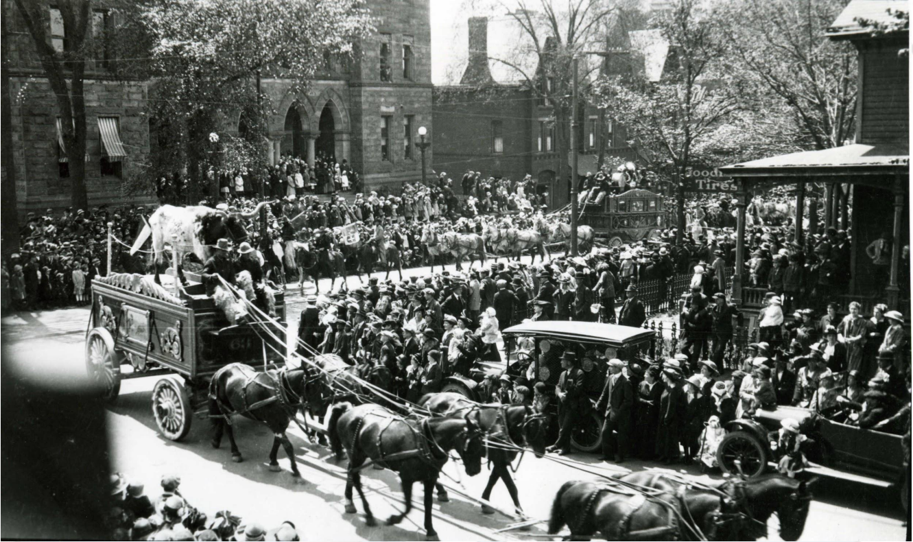
Circus parade, Scranton PA, circa 1905. A horsedrawn wagon carrying oxen rounds the corner at Mulberry Street in front of City Hall.