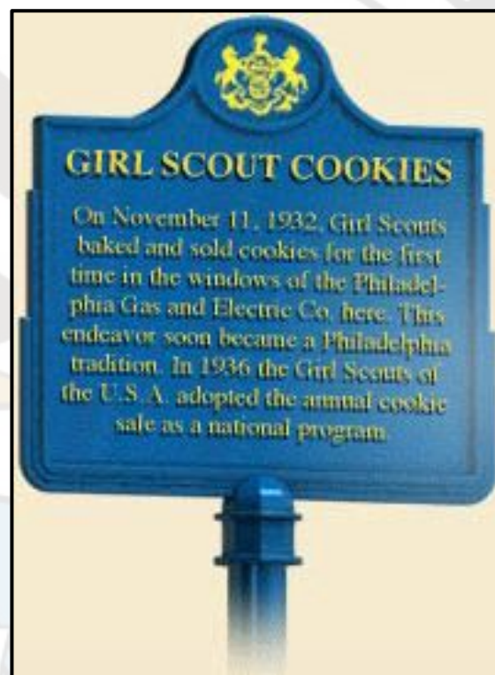
PHMC. "Girl Scout Cookies Historical Marker." ExplorePAHistory.com , WITF, explorepahistory.com/hmarker.php?markerId=1-A-359 .

Would you like to locate a historical marker within your county? Take a look here !