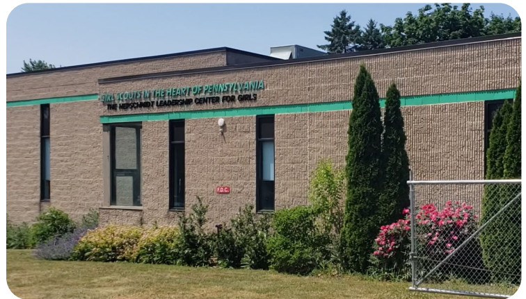
Hale Avenue Office

About 50 years later, Girl Scouts relocated to Hale Avenue headquarters in Harrisburg. Although this home served the organization well for the next half of a century, it continued to outgrow the space, prompting the move to Trindle Road and setting the stage for the next 50 years and beyond for Girl Scouts in the Heart of Pennsylvania.