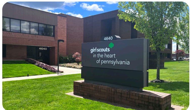
Trindle Road Headquarters

As we settle into our newest home, we are looking forward to the next 50 years as we continue growing girls of courage, confidence, and character who make the world a better place.