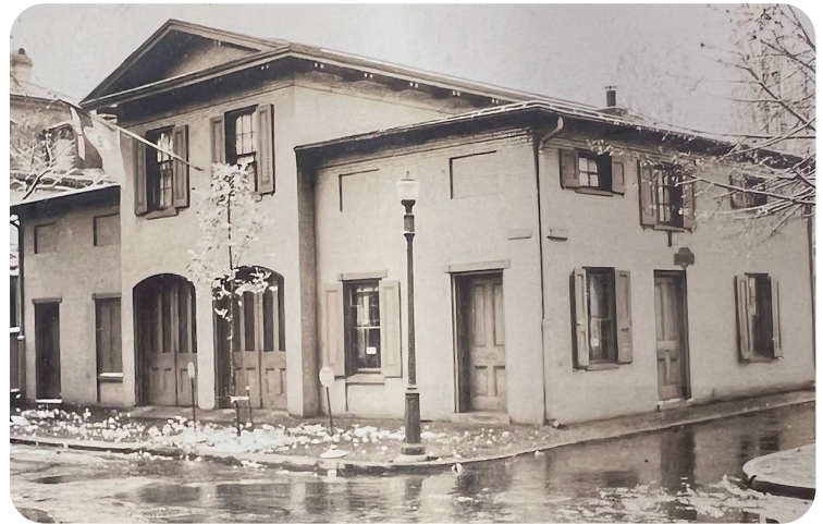
Carriage House, Pine and River Streets

Remodeled to accommodate programming and activities, the building featured room for administrative staff on the first floor and a large activity space upstairs, complete with a fireplace, a small kitchen, and a demonstration room for girls to show off their skills to qualify for badges.