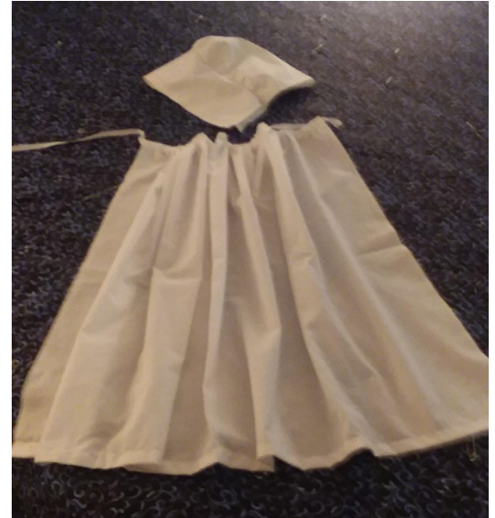
Photo of Foxfire cap and apron

The fabric will be self-gathering on the tape or ribbon and the length that extends out will be the ties.